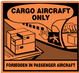
Cargo Aircraft Only 110 x 127mm